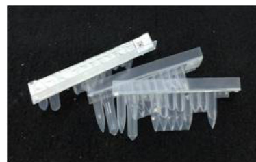
Fig. 2: MagDEA Dx SV cartridges for nucleic acid purification on the magLEAD 6gC and 12gC.

The optimized protocol uses magnetic bead-based chemistry to rapidly extract and purify high quality nucleic acids with excellent reproducibility and from a range of sample types. No additional reagents are required. Each cartridge is labeled with a 2D barcode for reagent tracking. MagDEA Dx SV kits are CE-IVD marked and suitable for diagnostic applications.